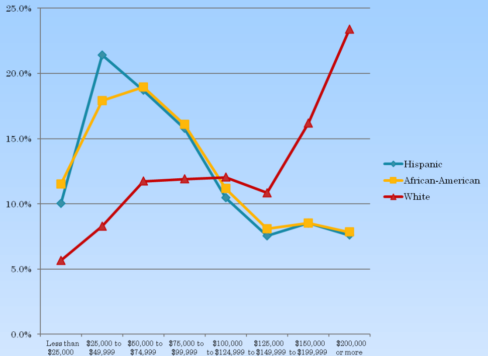
2011 Fairfax Household Income by race, U.S. Census

Fairfax Median Income is $105,797/yr and cost of living index is 140%